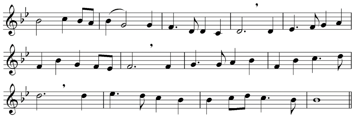
Sing, choirs of heav'n, rejoice around God's throne, Rejoice, O earth, for death is overthrown, The darkness of this world is put to flight, The Saviour reigns in everlasting light! AC