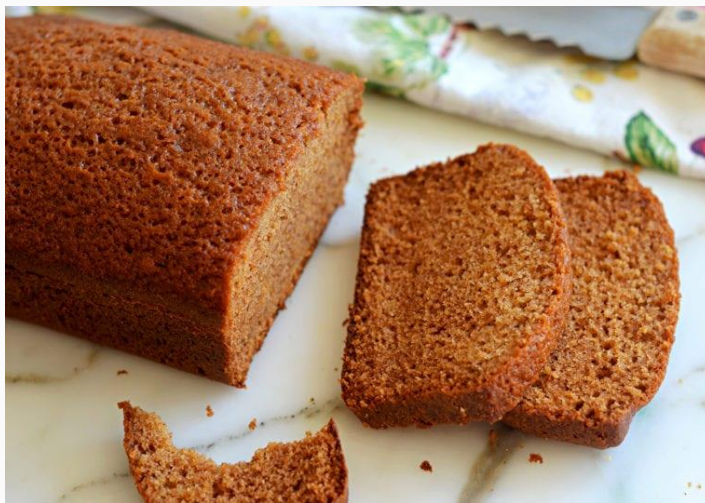
Honey Loaf Cake